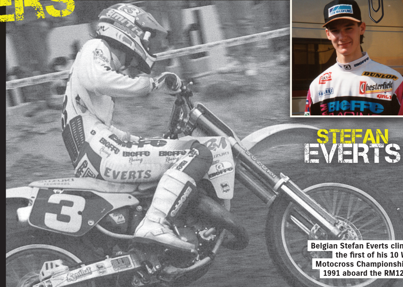
Belgian Stefan Everts clinched the first of his 10 World Motocross Championships in 1991 aboard the RM125WS.