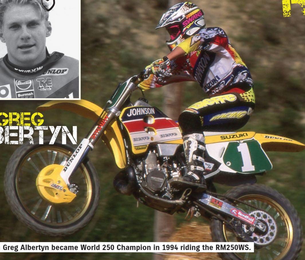
South African Greg Albertyn became World 250 Champion in 1994 riding the RM250WS.