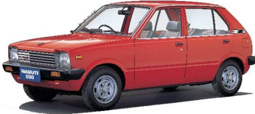
First model, Maruti 800