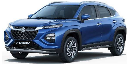
Popular SUV, Fronx

Suzuki Motor Corporation has achieved accumulated automobile production of 30 million units in India by the end of March 2024. India becomes the second country after Japan in which Suzuki has reached this milestone, and the fastest country to reach 30 million units in just 40 years and 4 months since starting production in December 1983, breaking the record of 55 years and 2 months in Japan.