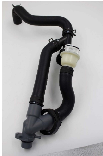
Outboard motor with Micro-Plastic Collecting Device (left), and the Device (right)

Suzuki Motor Corporation started production of 5 mid-size outboard motors with the world's first Micro-Plastic Collecting Device as standard equipment in July. The product will be shipped worldwide, including to major markets such as North America and Europe.