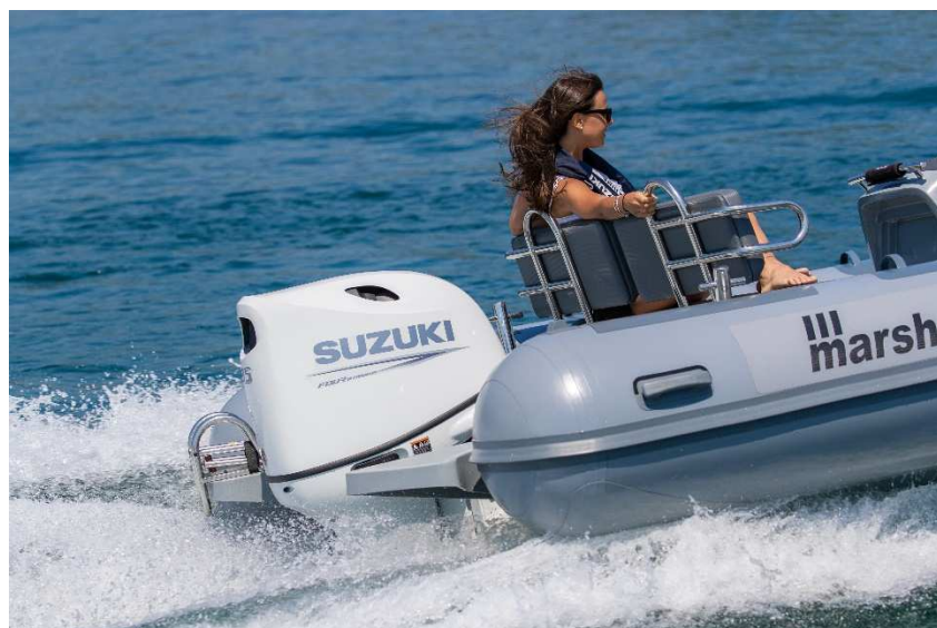
Boat equipped with DF115B