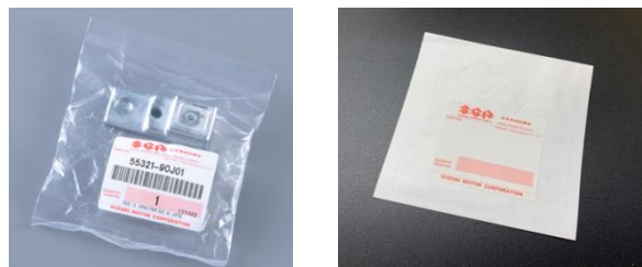
Conventional packaging (left) and paper packaging (right) of Suzuki marine genuine parts

For part of the Suzuki marine genuine parts, we have started replacing packaging materials from plastic to paper beginning with October 2020 shipment. Approximately 2.3 tons of plastic will be reduced every year if all packaging of marine genuine parts are replaced to eco-friendly materials.