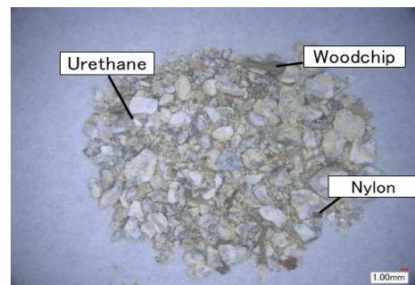
Actual micro-plastic waste collected during the monitoring research