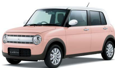
Coffret Pink Pearl Metallic x white roof x brown fender molding (three-tone color)