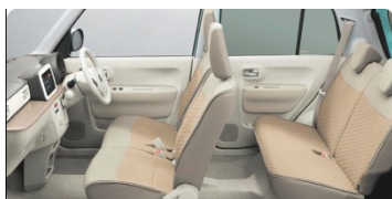
Grege interior x camel seat fabric