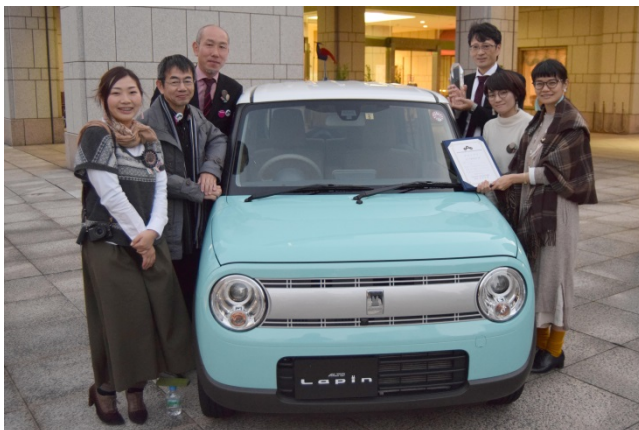
Color team of the Design Department

Suzuki Motor Corporation's Alto Lapin* minicar has won the Grand Prize of the Auto Color Awards 2015-2016, which is organized by the Japan Fashion Color Association (JAFCA). The examination took place on 12 December, 2015 at the Yokohama Museum of Art. The Grand Prize is awarded to the most excellent overall color design. It is the second Grand Prize for Suzuki following the Hustler minicar in the previous year.