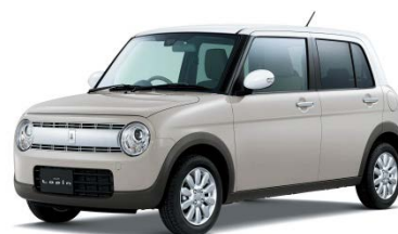
Fawn Beige Metallic x white roof x brown fender molding (three-tone color)