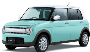
French Mint Pearl Metallic x white roof x brown fender molding (three-tone color)

Awarded model: Suzuki Alto Lapin (three colors)