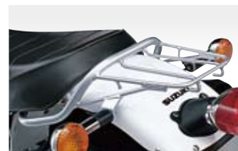
Grab bar / luggage carrier