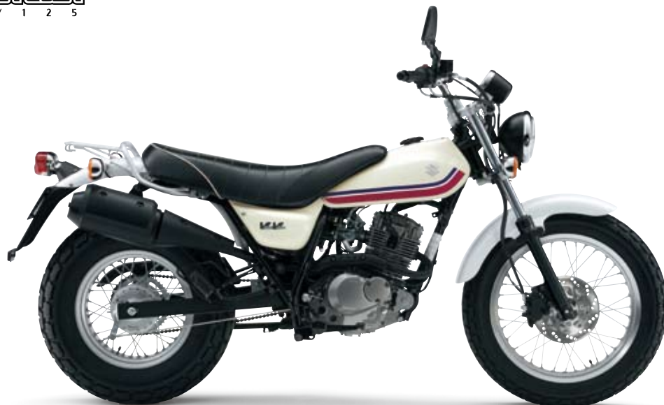
Pearl Mirage White (YPA)