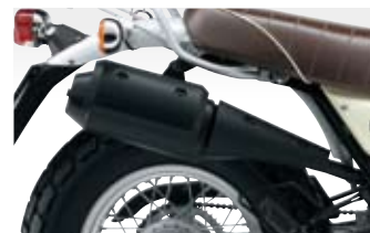
Extra-large, high-positioned muffler