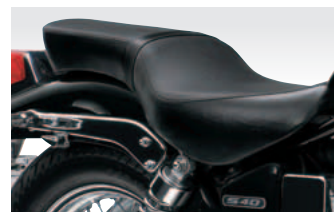
Wide comfortable seat