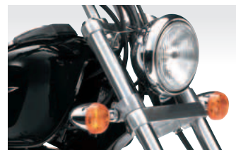
Multi-reflector turn signals