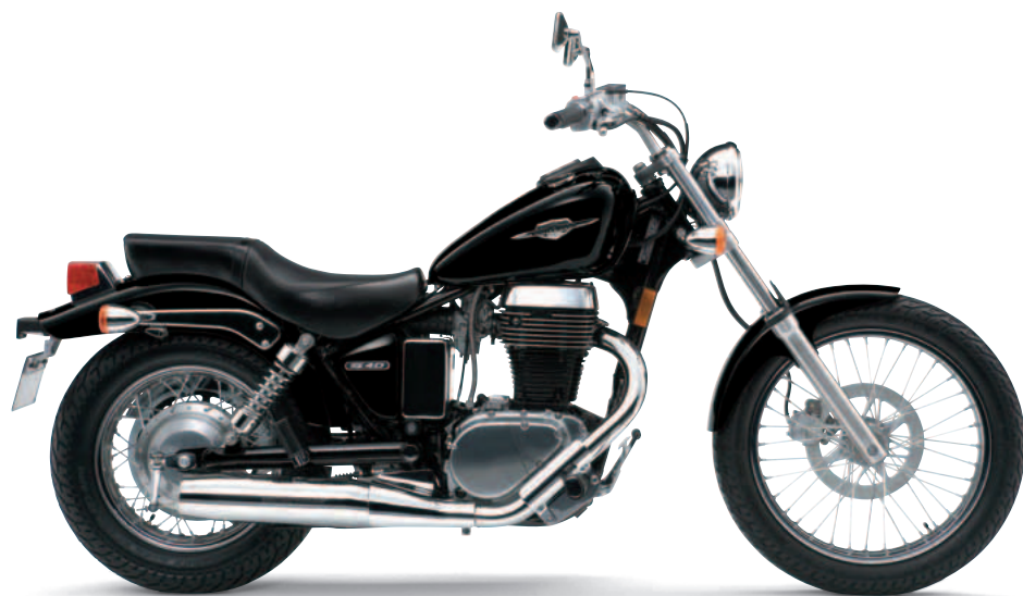
Pearl Nebular Black (YAY)