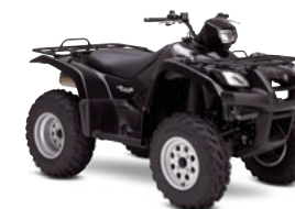
Solid Black No.2 (YLZ)

Specifications, appearances, equipments, colors, materials and other items of "SUZUKI" products shown on this catalogue are subject to change by manufacturers at any time without notice and they may vary depending on local conditions or requirements. Some models are not available in some territories. Each model might be discontinued without notice. Please inquire at your local dealer for details of any such changes. Actual body color might differ from the colors in this catalogue.