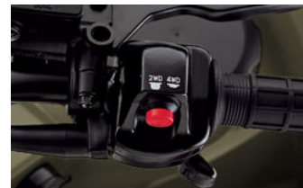
Mode selection switch for 2WD and 4WD