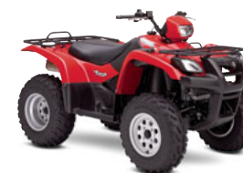
Flame Red (YT9)