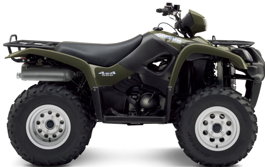
Terra Green (YLG)