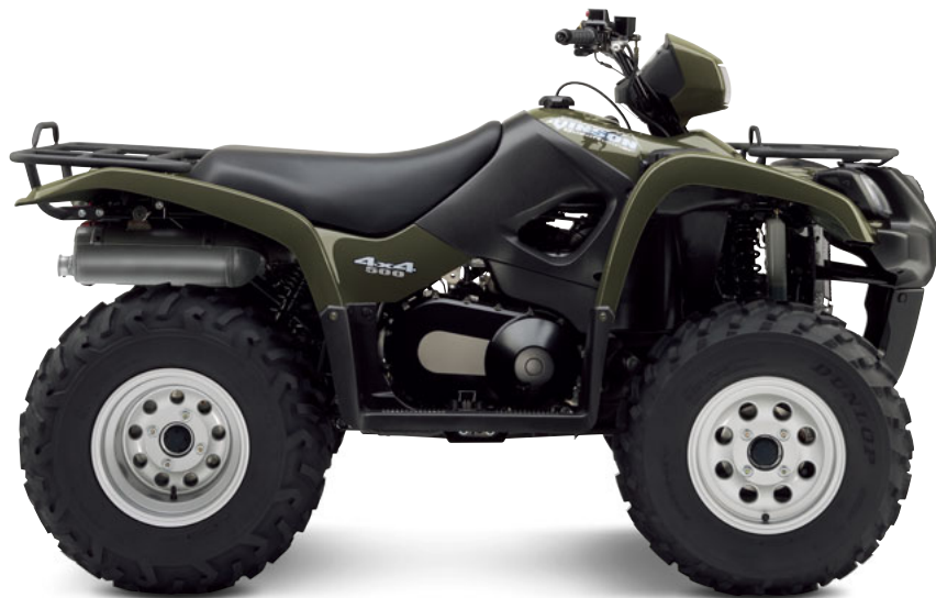
Terra Green (YLG)